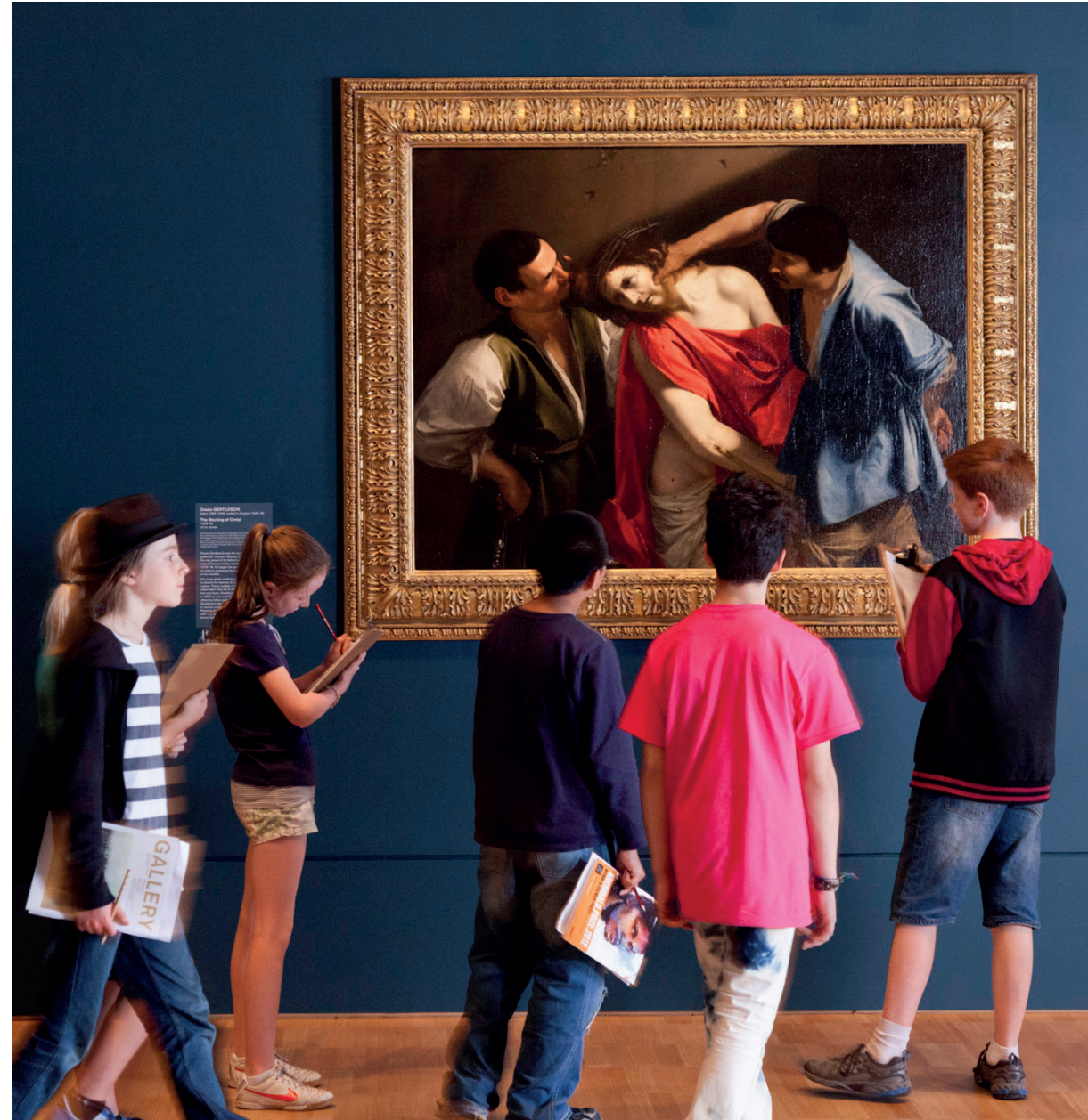
Students from North Melbourne Primary School viewing Orazio Gentileschi's The mocking of Christ 1628–35

Extended or tailor-made programs with a particular focus for a faculty, year level group, or whole school staff can be developed upon request Cost $330 (2 hours per 20 staff)