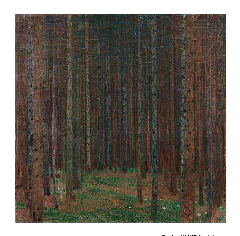
Gustav KLIMT Austria 1862–1918 Forest of Firs / 1901. Oil on canvas, 90.5 x 90.0 cm. Kunsthaus Zug. Stiftung Sammlung Kamm

How does the medium used contribute to the emphasis of each artist?