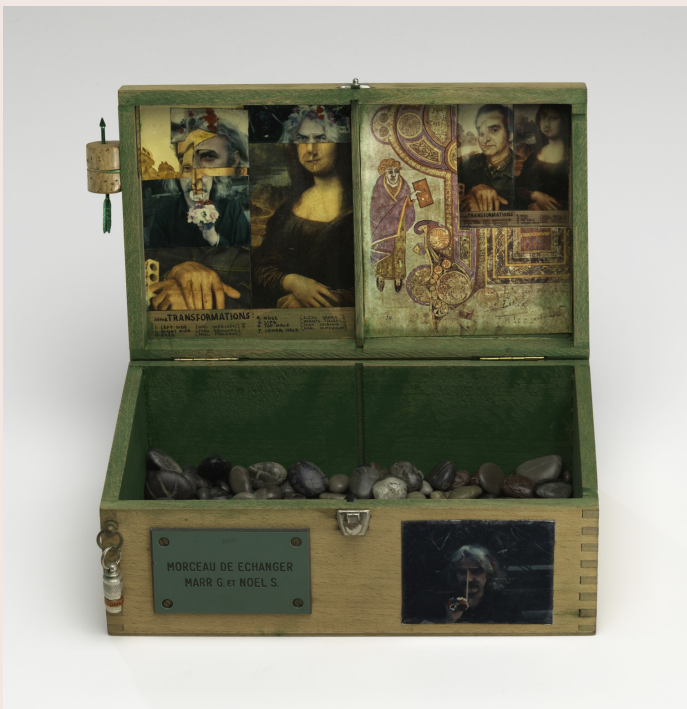
Marr Grounds and Noel Sheridan Small things to exchange (Morceau de exchanger) (1977–1978) (part). National Gallery of Victoria, Melbourne © Courtesy of the artist

You can create your own memory chest using the template on page three. Decorate with your favourite things and use it to store your special collections.