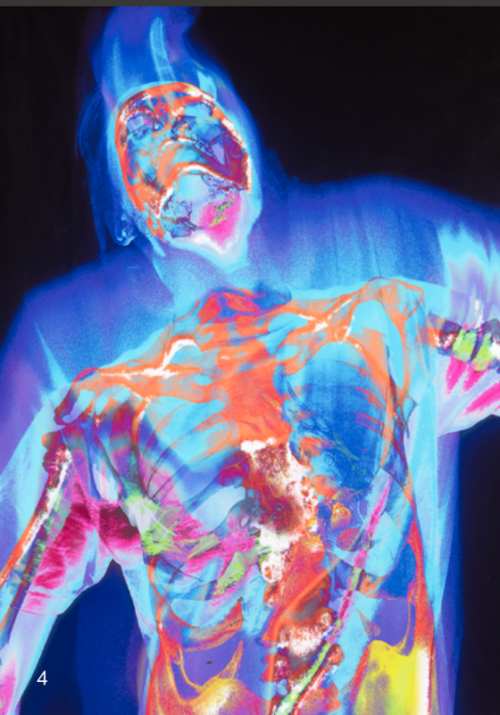
◀ Ethan Mangopoulos My life, 2024 © Ethan Mangopoulos