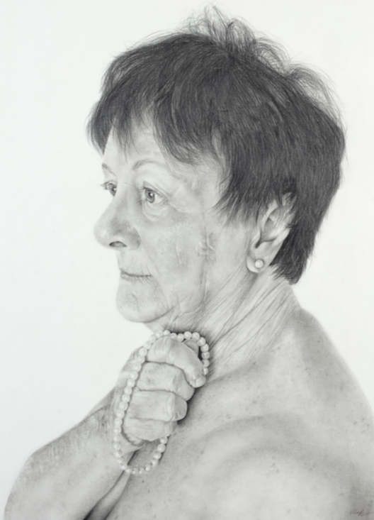
Maya Shookry Non , 2024 © Maya Shookry